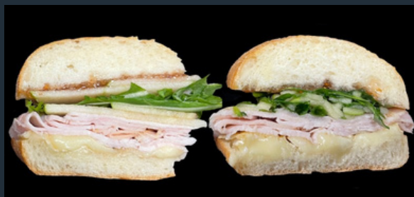
Let it Brie