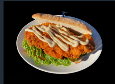
Buffalo Fried Chicken Sandwich