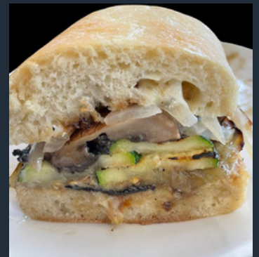
Grilled Veggie Sandwich