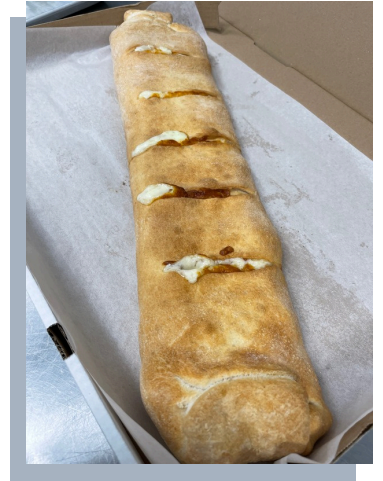
Ham and Cheese Rotolo