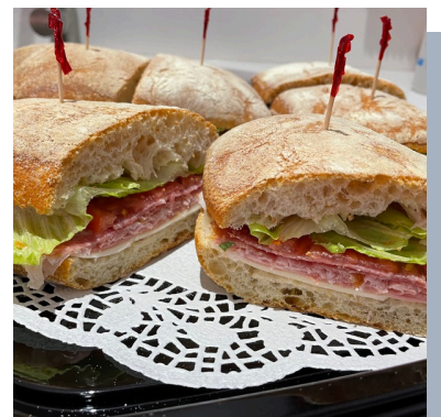
Mini Deli Panini