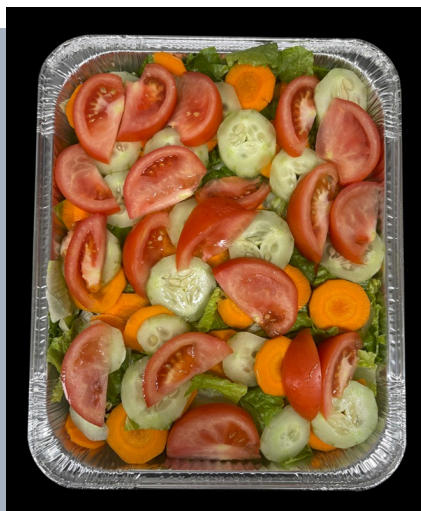
House Salad - undressed