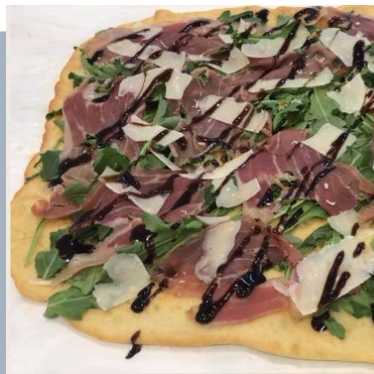
Prosciutto Arugula Flatbread